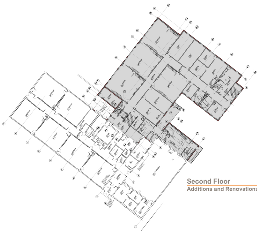
Second Floor Additions and Renovations