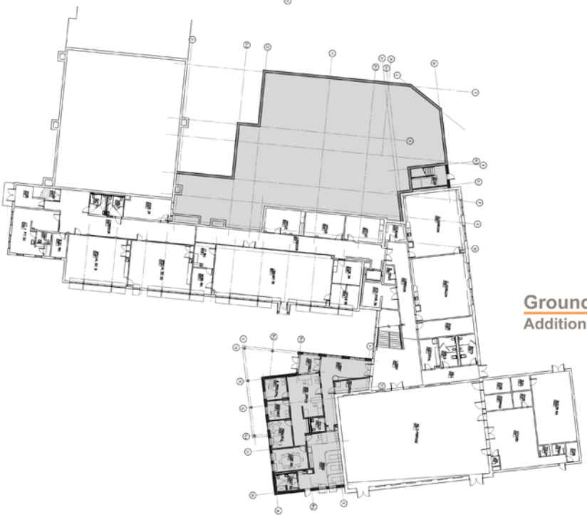
Ground Floor Additions and Renovations