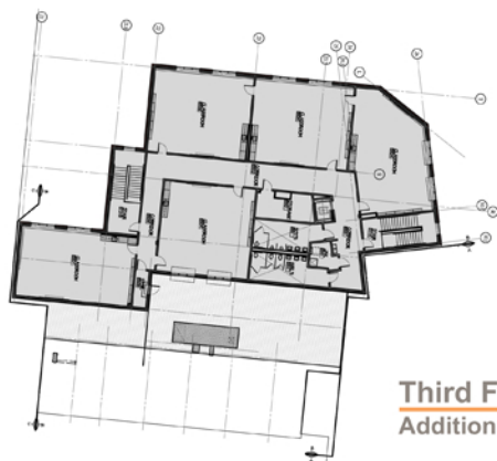
Third Floor Additions and Renovations